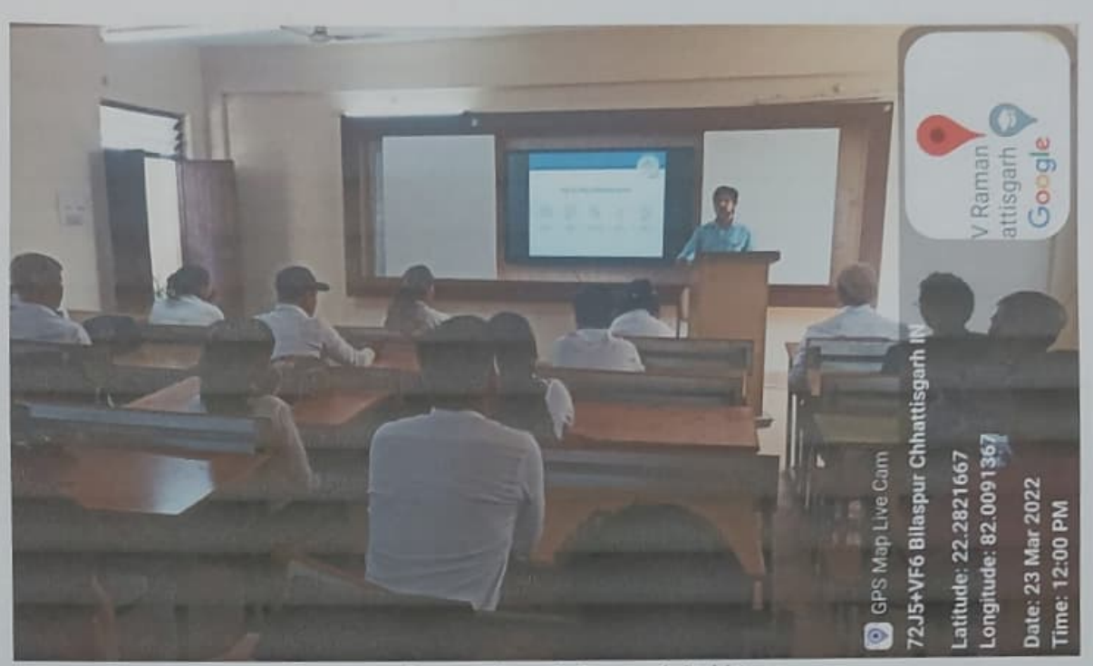
Literature Review through Research Rabbit